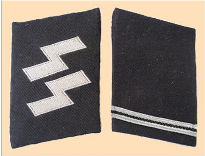
Sturmmann Type 3 - 1940-45