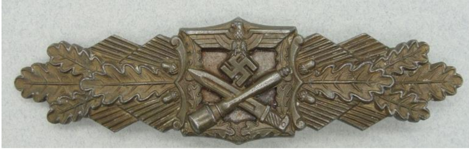
Army/Waffen-SS Close Combat Clasp, Bronze...