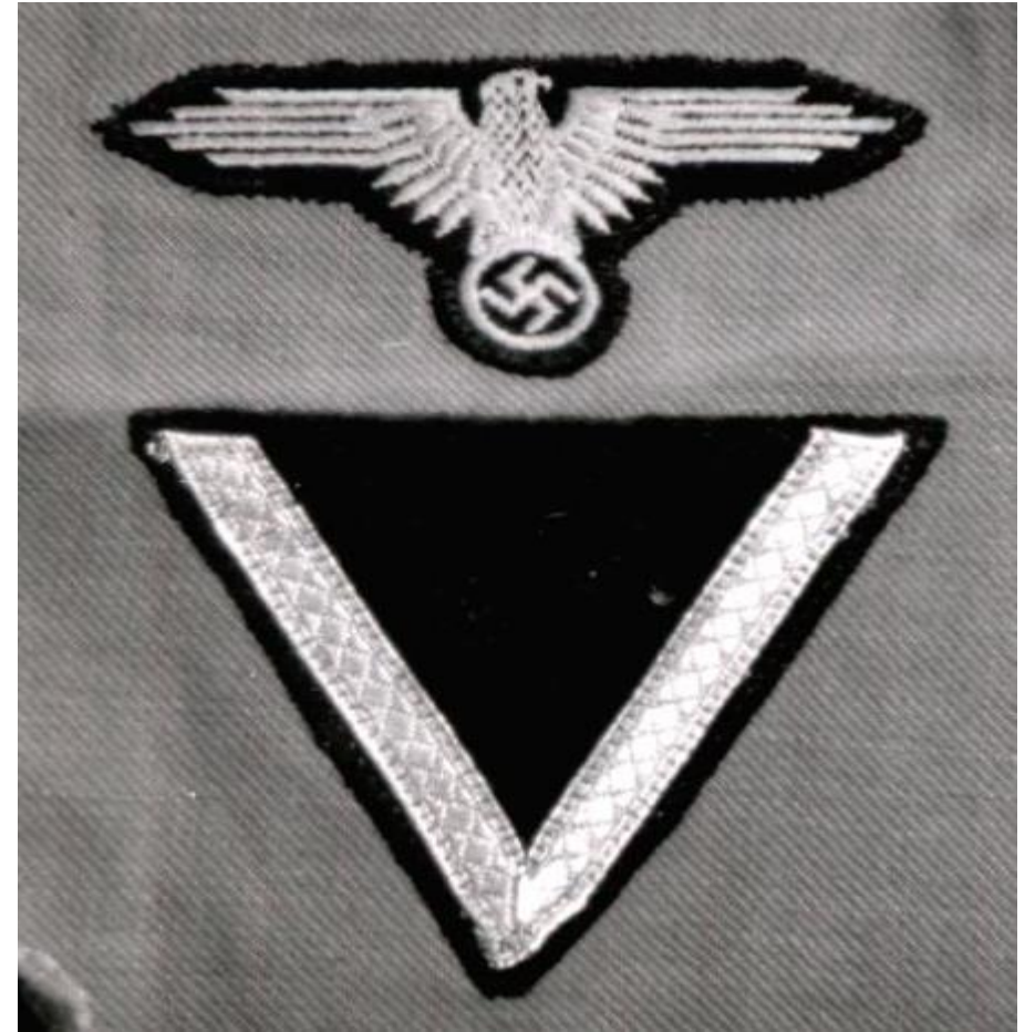
Left Sleeve Insignia